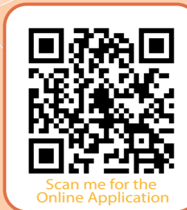
Scan me for the Online Application

FOREVER GREEN DENTAL PRODUCTS LIMITED Unit 1202, Lippo Sun Plaza, 28 Canton Road, Tsim Sha Tsui, Kowloon, Hong Kong Tel: (852) 2388 2798 Fax: (852) 2332 8183 E-mail: forevergreendental@gmail.com