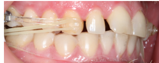
Class I Occlusion with MOTION 3D CLEAR Average 3 to 4 Months