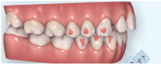
Class I Occlusion with 70 Aligners 18+ Months